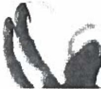
Adult louse claw

They are most commonly found on the scalp, behind the ears and near the neckline at the back of the neck. Head lice hold on to hair with hook-like claws found at the end of each of their six legs. Head lice are rarely found on the body, eyelashes, or eyebrows.